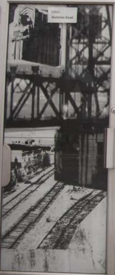
1927 Marion Road